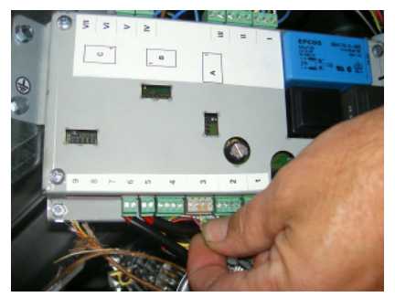
Fig. 2: Plug position on the main board

Connect the control cable in the correct wire sequence to the 4-pin plug supplied (as shown in figure 4). Plug the plug into the socket of the pellet control. Now snap the front section of the pellet control into the rear housing panel.