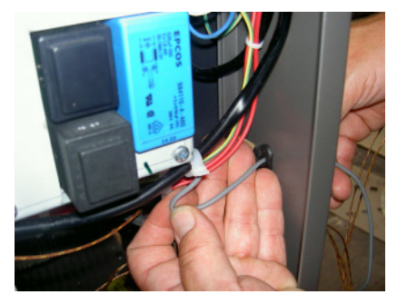
Fig. 1: Routing of cable through, rear panel

After routing the cable, guide the cable through the plastic grommet (figure 1). Push it through the bracket and connect to connector 3 (figure 2).