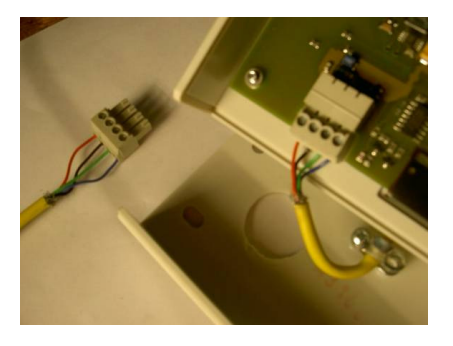
Fig. 3: Multiple pin strip cable of the pellet control

Connect the control cable in the correct wire sequence to the 4-pin plug supplied (as shown in figure 4). Plug the plug into the socket of the pellet control. Now snap the front section of the pellet control into the rear housing panel.